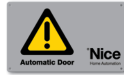
TS signboard Pc/Pack. 1