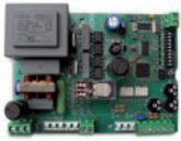
ROA37 spare control unit